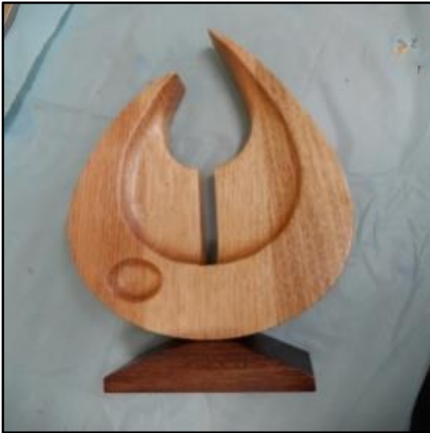
Malcolm Liggins made an abstract item from Mountain Ash with a Red Gum base and finished it with wipe on satin poly.