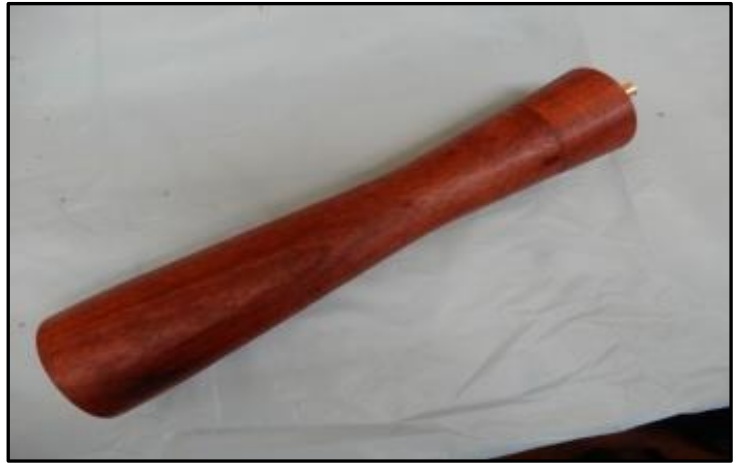
Graeme Ingleton turned a 12 inch pepper grinder from Red Gum and finished it with Organ Oil.