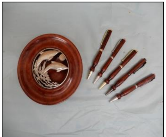
Ben also turned 5 Pens from Red Gum they were well finished with 6 coats of c.a.super glue.