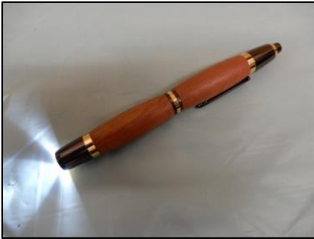
Ashley Thompson turned a Pen Light from Red Gum with EEE Ultrashine and shellawax.