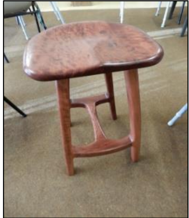
Ralph Chilver made a bar stool from recycled Red Gum house stumps and finished it with 4 coats of spray on Mirotone Lacquer. The stool was from Australian Woodworker issue 185 Feb. 2016.