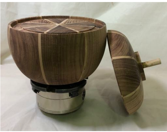
This segmented lidded bowl is a work in progress by Lionel Hart. The wood is mainly Blackwood.