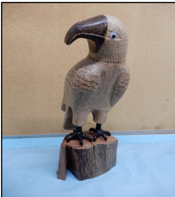
Ralph Chilver carved a 300mm eagle from White Beech and finished it with 2 coats of water based Estapole. This was his first attempt at carving and pyrography. The item was taken from an article in the 185 th issue of the Australian Woodworker.