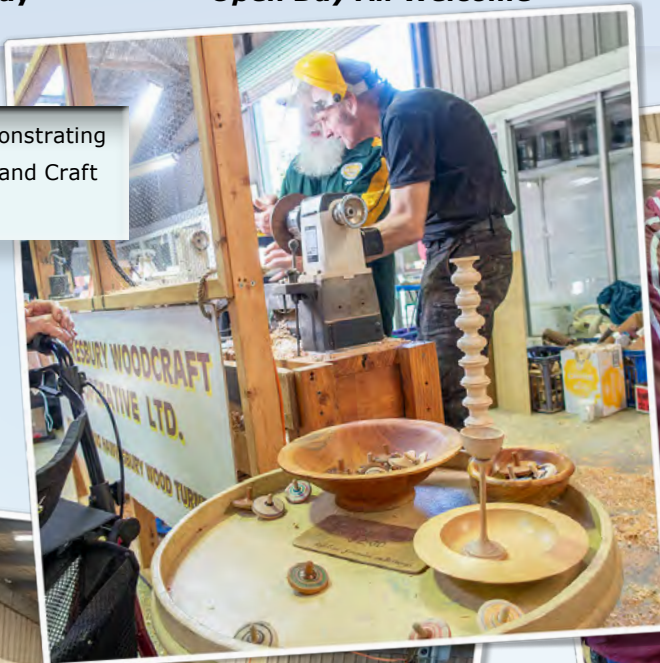
our woodturners demonstrating at the Woodworking and Craft Show