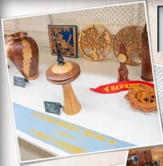
Some more Members' work on display at Woodworking and Craft Show