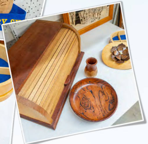
Members' work on display at the Woodworking and Craft Show