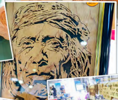
Some Members' work on display and for sale at the show