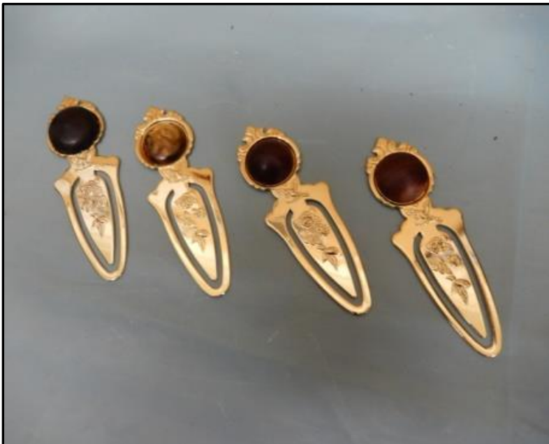
John Cruickshank turned the wood inserts for 4 book marks from Crushed Velvet - African Ebony and Purple Heart and finished them with Friction Polish.