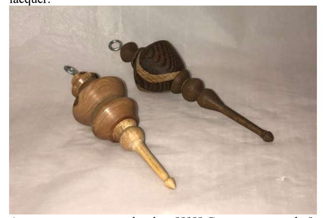
A secret turner, not on the sheet????? Can you guess who?

November 4-5 Whittlesea Show *** Eltham and Districts Woodworkers Exhibition November 10-11 Eltham Community Centre