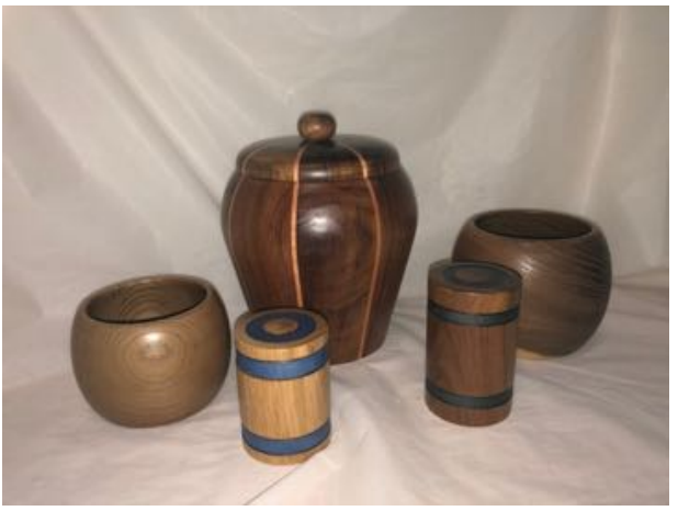
Lionel haas also made these itiems. The urn is Blackwood & finished with Nitrocellulose Lacquer. The 2 bowls are Elm with the same finish. The lidded boxes are American Oak & Blackwood with painted accents & Nitrocellulose lacquer.