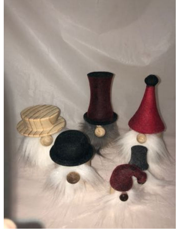
Peter Fisher has made these ornaments. The lidded box is Merbau & it is finished with Bees Wax. The Gronks are various woods & flocking has been used in the finish.