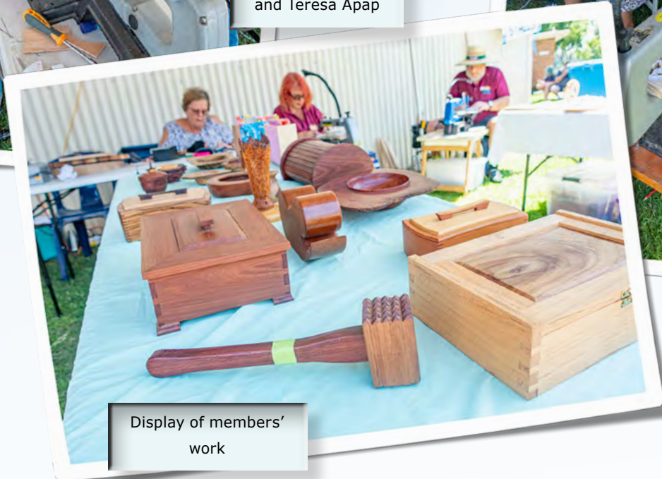
Display of members' work