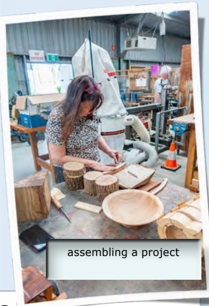
assembling a project

Wood Turning Lessons Wood Turning Lathes, Tools & Accessories Timber for all home, school or trade projects 100 Australian/Imported species box sets, Sandpaper, Wood Glues, Finishes & Wood Sample Collection Contact us today for our list of species