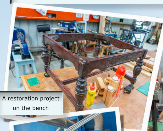
A restoration project on the bench