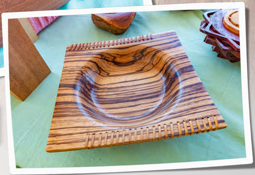
Some more Members' work on display at the Lions' Markets