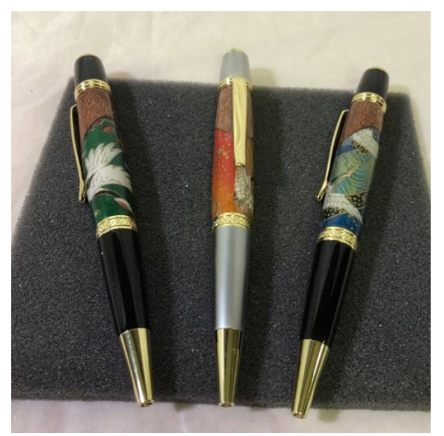
This design was inspired by an Oops. Peter has used Japanese paper with Banksia to make these pens.