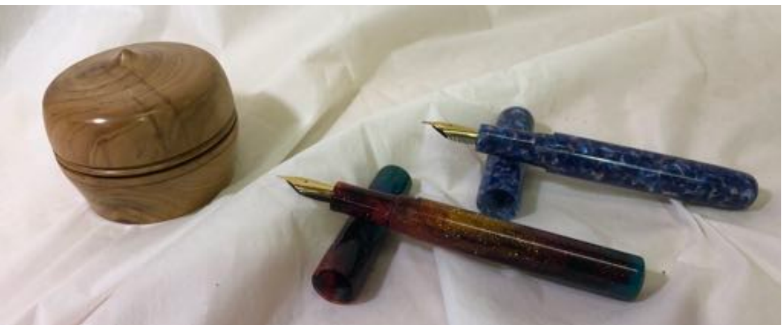
Ian Beckett has made the box from Cyprus abd finished it with Shellawax. The 2 resin fountain pens are kitless pens – Ian has turned the threads in these pens.

Coming Events Warrantina Lavender Farm Woodworking Expo September 9-17 Wandin Nth