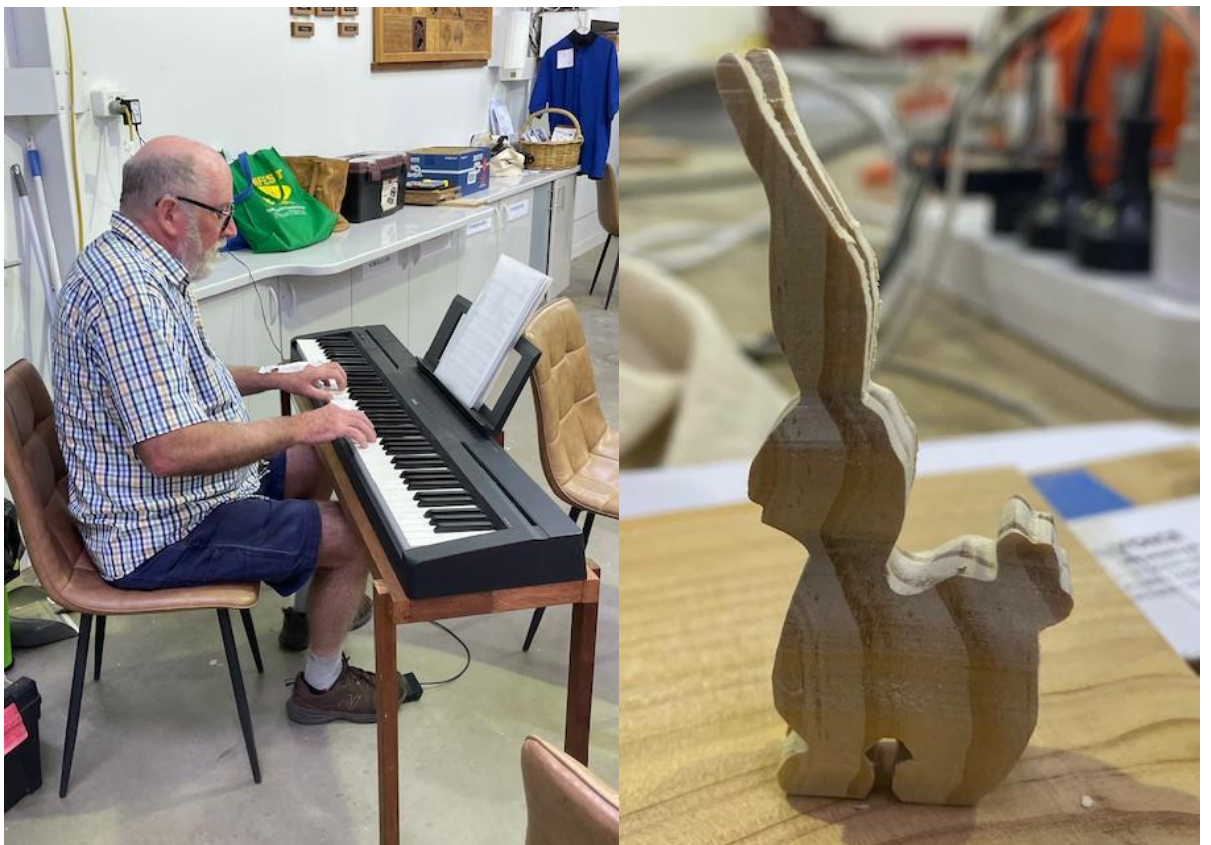
Loretta's 3D bunny before sanding