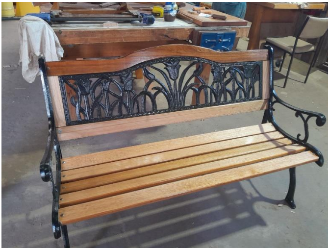
Bob's restored garden seat.