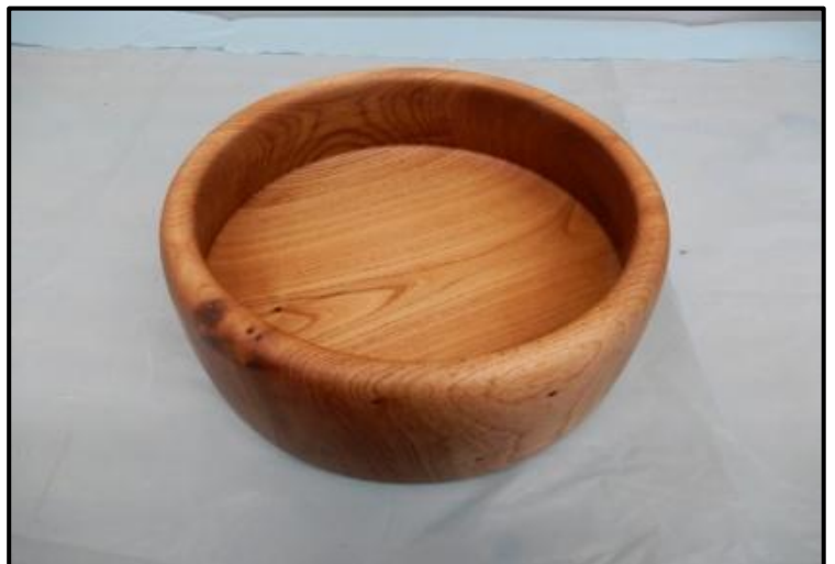
Norm Hyde turned a 200mm x 70mm bowl from Blackwood and finished it with Hard Burnishing Organ Oil.