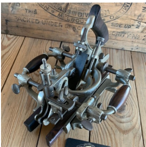
Vintage Stanley USA No. 55 universal combination plane for making your own mouldings & profiles, etc.