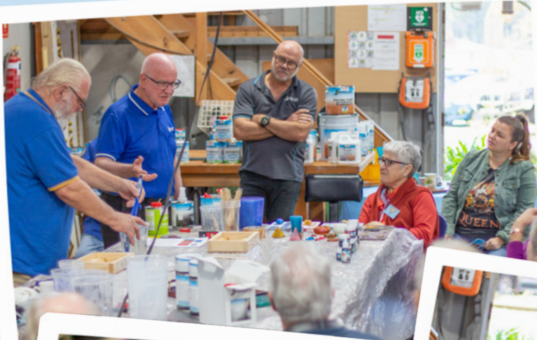
Some Scenes of the enthralled crowd at the Norglass Presentation