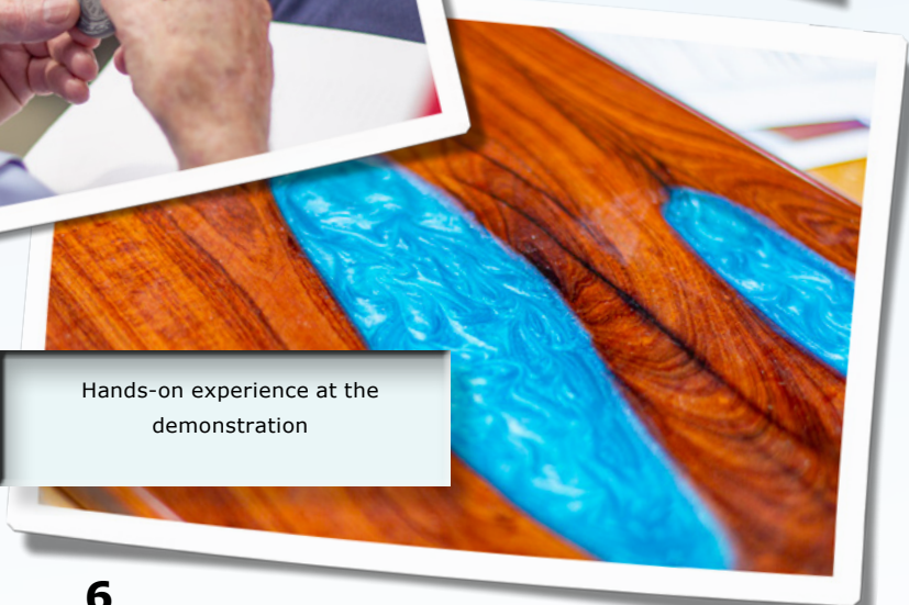
Hands-on experience at the demonstration