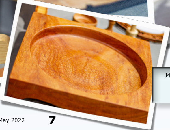
Member's Work on display at the Norglass Demonstration