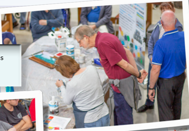
More scenes at the Norglass Demonstration