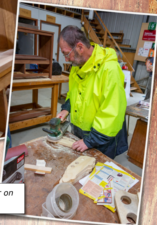
using the orbital sander on wooden toys