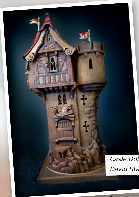
Casle Doll's House