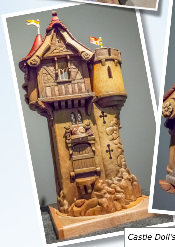
Castle Doll's House