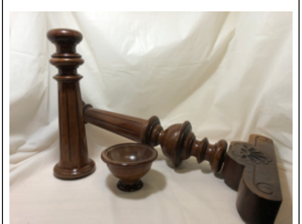
Lionel Hart is repurposing piano legs. From this beautiful Walnut piano leg, he has made a pepper grinder and a lidded box (the lid is still under construction).