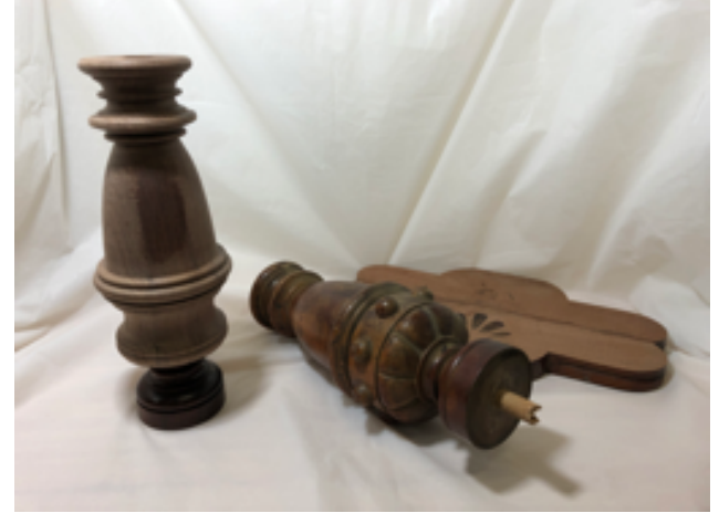
Another style of piano leg to work on. The piece at the back is from the leg on the left and will be used to make the lid of the box and a final. Who knows Peter might score some pen blanks too. There is a lot of work in cleaning up years of wax and the original lacquer but it is worth it.