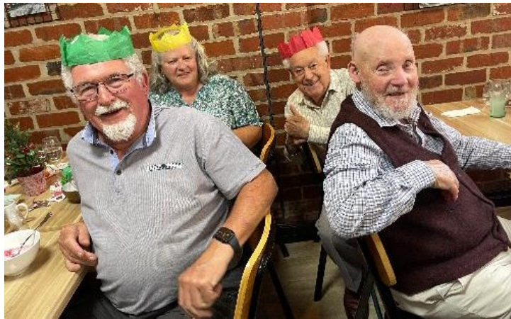
Winning raffle prizes and just joining friends for some fun and Christmas cheer.