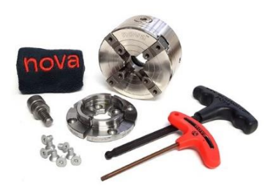
NOVA SN2 PRO-TEK CHUCK TK-SN2-PT

Carbatec. CARBATEC CRYOGENIC LARGE WOODTURNING CHISEL SET - 6PC CT-WTC-6CT-CRYO