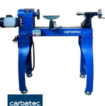
CARBATEC DELUXE ELECTRONIC VARIABLE SPEED LATHE WL-1624P