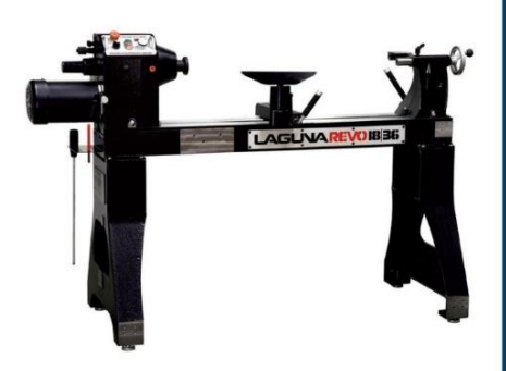
LAGUNA REVO 18/36 LATHE LGT-REVO-1836

Visit your local store, carbatec.com.au or call 1800 658 111 Adelaide • BRISBANE • HOBART • MELBOURNE • PERTH • SYDNEY • AUCKLAND • CHRISTCHURCH