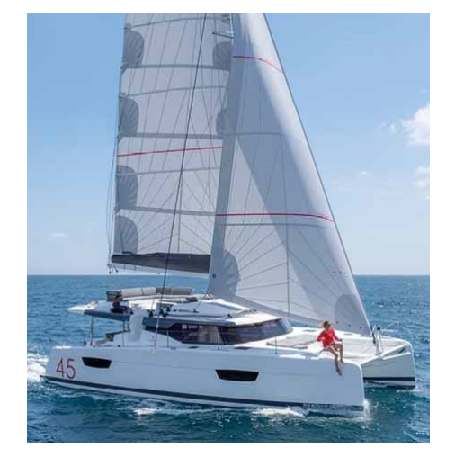
Google image of Elba 45 cruising catamaran