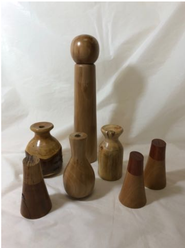
Ian Beckett has made these items. The pepper grinder is Pear and finished with Nitrocellulose lacquer. The off centre Salt and Pepper shakers are assorted woods and finished with Nitro. The bud vases are Pear and Birch and finished with Shellawax.