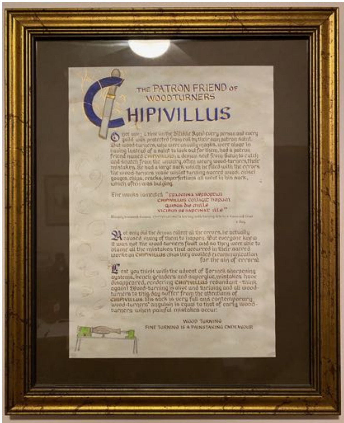
'Chipivillus' - I re-wrote this piece to make it about wood turners rather than ancient scribes (Originally Titivillus – google this)