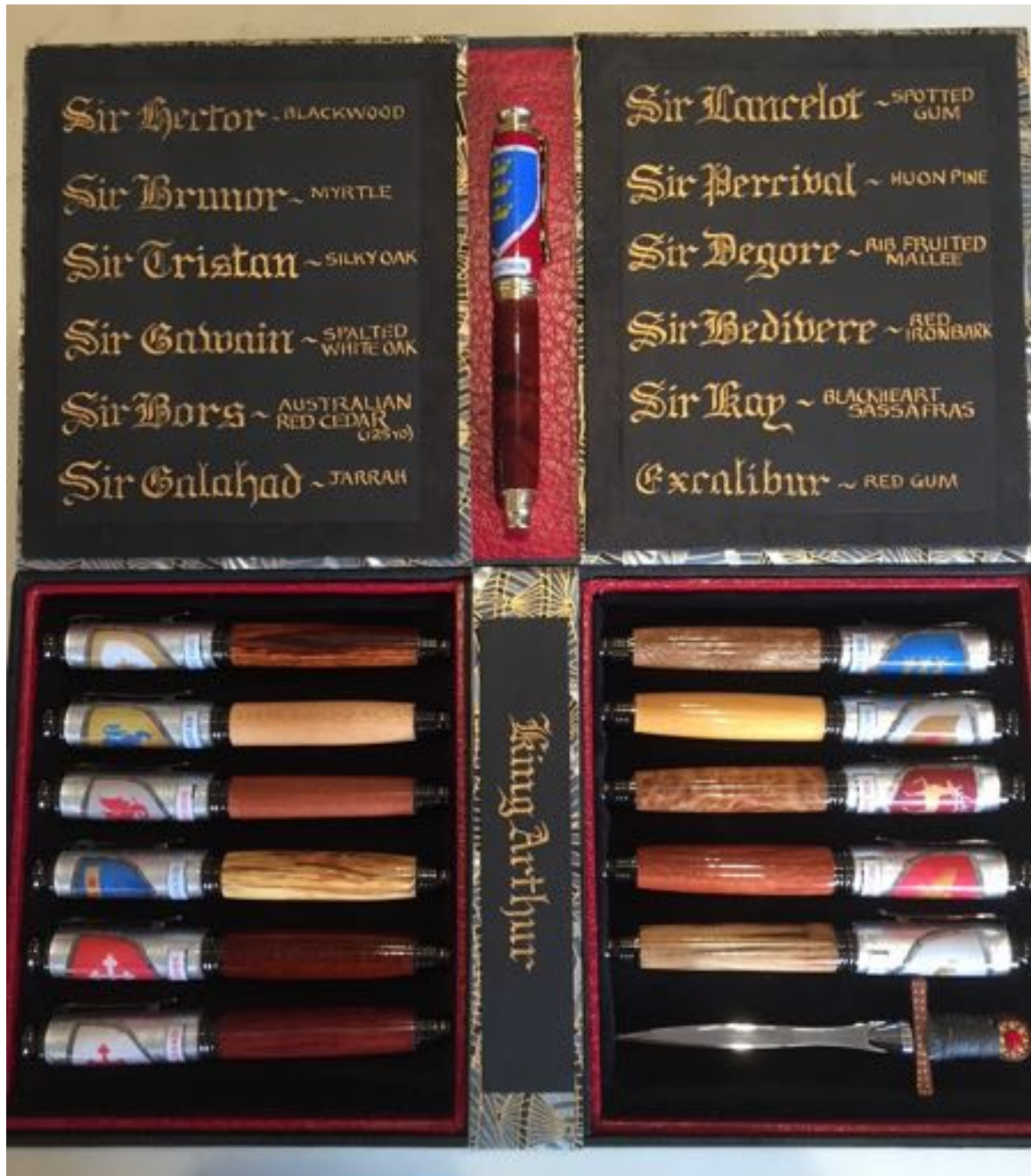
King Arthur and the Knights of the Round Table boxed set.