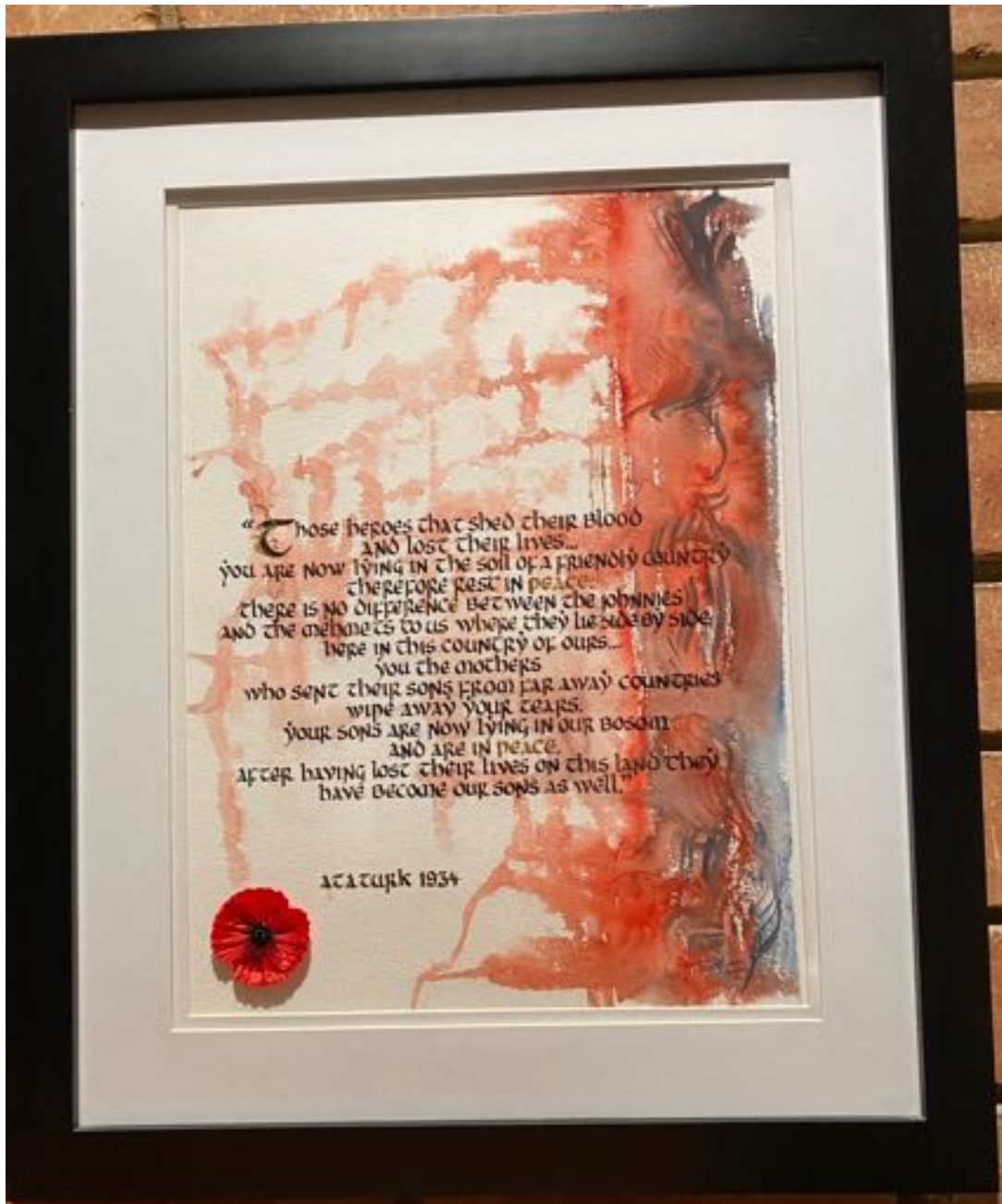
A famous 1934 poem by Ataturk, the leader of the Turkish troops at the disastrous Anzac cove. This is inscribed on a stone plaque on the shore at the beach.